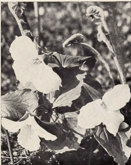
SNOW TRILLIUM Trillium Grandiflorum